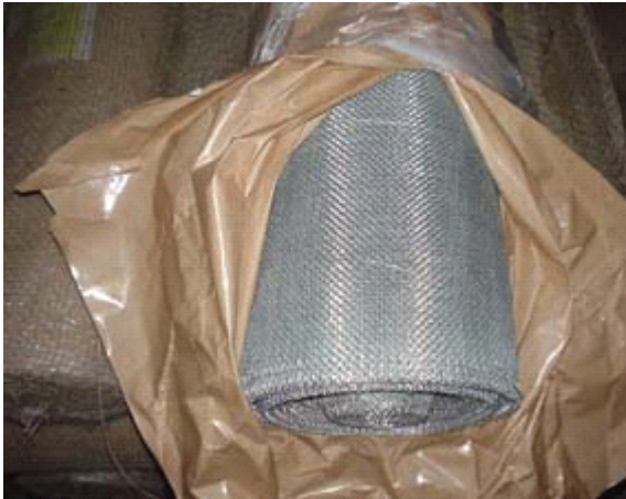
Iron Wire Window Screening