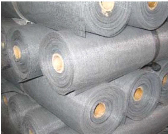
Iron Wire Window Screening